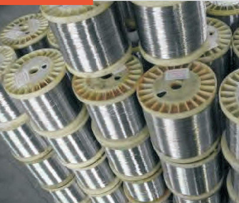
Eastto Metal Drawing 15